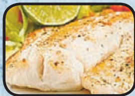
B. "Lake trout" (Atlantic white fish)