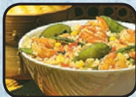
G. Chinese food