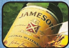
E. Jameson whiskey