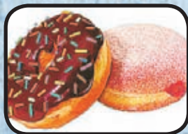
F. Dunkin Donuts