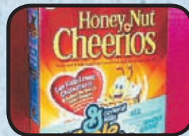
D. Honey Nut Cheerios