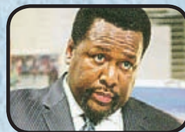
7. Det. Bunk Moreland